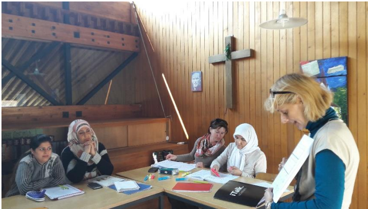
Literacy Course