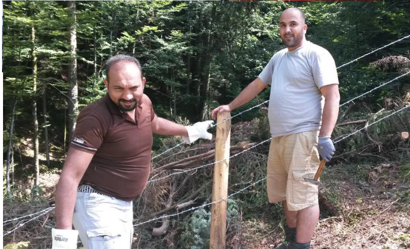
Wir sind aktiv