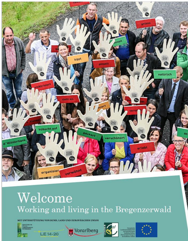
LEADER project vorankommen