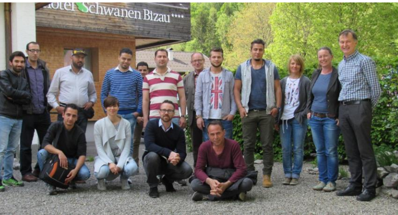
LEADER project vorankommen