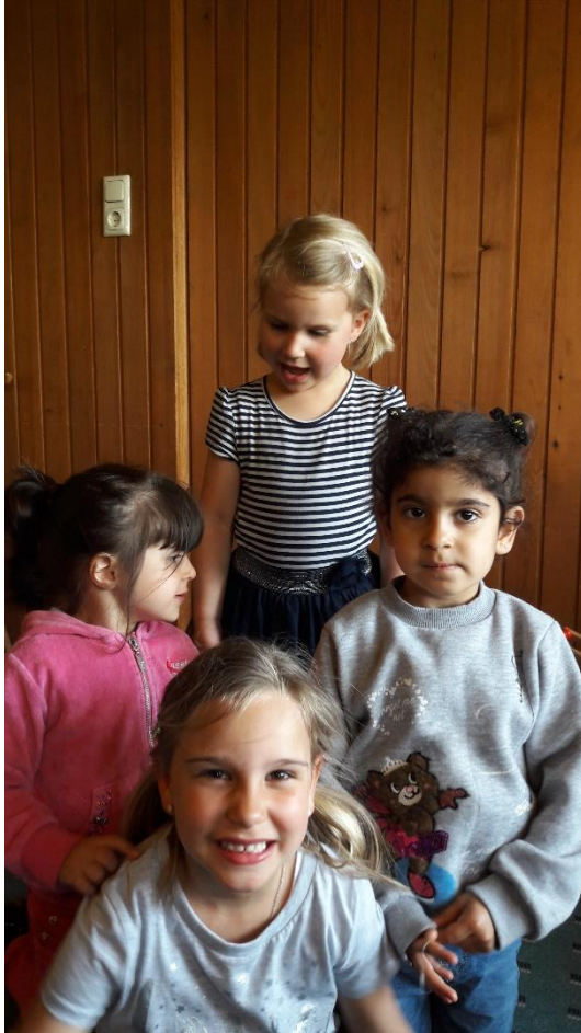
Literacy Course