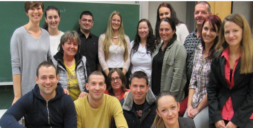
LEADER project vorankommen